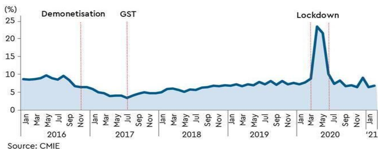
Unemployment bursts in the last 6 years