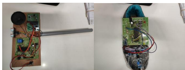
Fig.3. Hardware Implementation

The Device Is helpful for a visually impaired person to be independent in navigation and mobility. By the voice playback alerts from the cane module by detecting obstacles from shoe module.