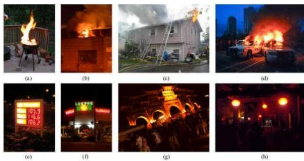
Figure 2: Sample of fire image

G. Laneve et al.,[10] The limits identified with the affectability of the geostationary sensor to fire sizes have been, essentially partially, defeat by presenting explicit calculations. Notwithstanding, the diminished exactness in the geographic localization of the fire, which can, on a basic level, possess any situation in a space of around 16 km 2 (at Mediterranean scopes), makes this data not extremely fascinating for the organizations associated with firefighting. This work investigates the attainability of working on the localization of the warm peculiarities (areas of interest) by consolidating images obtained simultaneously from various MSG satellites situated at various longitudes. Specifically, we consolidate the images obtained by MSG-9 situated at long. 9.0°, MSG-10 situated at 0.0° and MSG-8 situated at long. 41.5°.v.