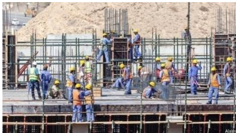
FIG 1.1 CONSTRUCTION SITE.

General: Construction industry is world's most largest and challenging industry. Human resource has a strategic role in increasing productivity in construction industry. With the effective and optimum use of human resources can help in productivity growth. The construction projects are mostly labour based with basic use of hand tools and equipment's in which labour cost consists of about 30% to 50% of total project cost. Indian construction industry is one of fastest growing sector globally. The construction sector gives second largest employment after agriculture. India shares about 8% of total GDP and also provides employment to around 35 million peoples directly or indirectly. In construction industry one of the biggest problems faced is of unskilled labour which implies in productivity loss and impacts on cost overrun and schedule daily.