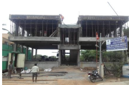
5.1 ON SITE