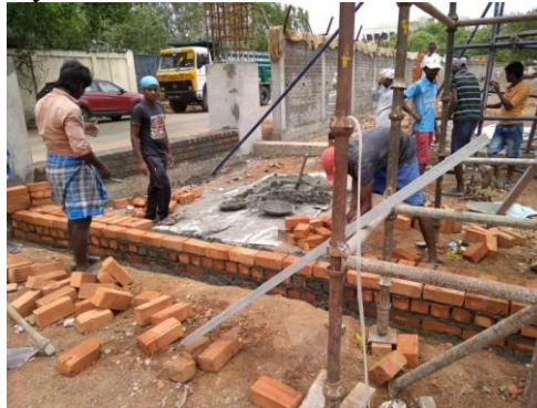
FIG 4.1: LABOUR PRODUCTIVITY

Productivity in construction is often broadly defined as output per labor hour. Since labor constitutes a large part of the construction cost and the quantity of labor hours in performing a task in construction is more susceptible to the influence of management than are materials or capital, this productivity measure is often referred to as labor productivity