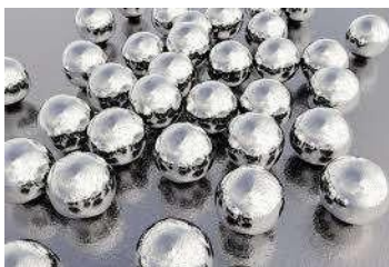
Fig 5 : Silver Nanoparticles

The researchers located that silver nanoparticles had a damaging end result on cells, suppressing cell increase and multiplication and causing necrobiosis relying on concentrations and duration of exposure. In particular, the two hundred nm silver debris brought on a concentration-structured boom in DNA harm within side the human cells.