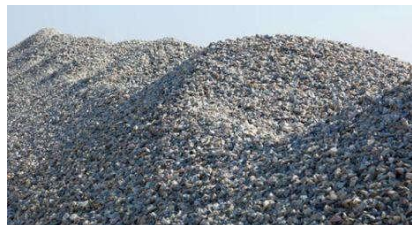
Fig.1 Coarse Aggregate

Coarse-grained mixtures won't tolerate a sieve with 4seventy five metric linear unit openings..Those particles that are preponderantly preserved on the 4.75 mm sieve and can pass through 3-inch screen, are referred to as coarse aggregate. The coarser the aggregate, the additional economical the mix. Larger items provide less area of the particles than identical volume of tiny pieces. Use of the biggest permissible maximum size of coarse aggregate permits a discount in cement and water requirements. exploitation aggregates larger than the utmost size of coarse aggregates permissible may end up in interlock and type arches or obstructions inside a concrete form. that enables the world below to become a void, or at best, to become crammed with finer particles of sand and cement solely and results during a weakened area. they're shown in fig.1 For Coarse Aggregates in Roads following properties are desirable Strength