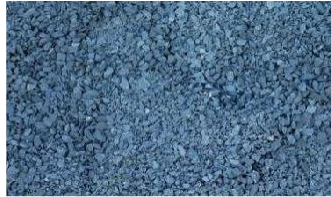
Fig .2 Fine Aggregate

The other sort of mixtures are those particles passing the 9.5 metric linear unit (3/8 in.) sieve, nearly entirely passing the 4.75 mm (No. 4) sieve, associate degree preponderantly preserved on the seventy five \mu\text{m} (No. 200) sieve are known as fine aggregate. For enlarged workability and for economy as mirrored by use of less cement, the fine aggregate ought to have a rounded shape. the aim of the fine aggregate is to fill the voids within the coarse aggregate and to act as a workability agent In concrete, an mixture is hired for its economic system factor, to reduce any cracks and most importantly to deliver energy to the structure. they're shown in fig.2