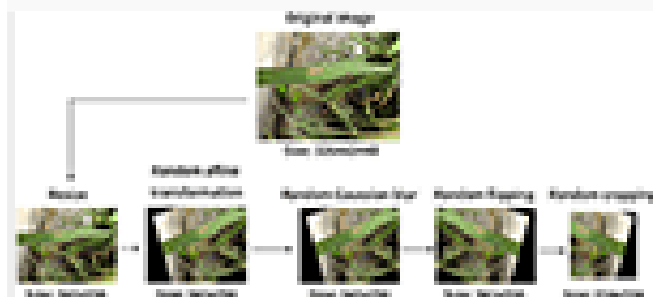
Figure 1.Steps of the image preprocessing for expanding dataset and reducing the overfitting of models.

Then, the mean and standard deviation of the ImageNet dataset were applied for standardization to make picture shading dispersion as comparable as could really be expected. As the quantity of pictures of various sorts of illnesses was not equivalent, an over-testing activity was taken on for few rice earthy colored spot pictures in the preprocessing, with a proportion of multiple times. This interaction was rehashed for each preparing age; consequently, the quantity of pictures that each model read was different in each preparing age, and the quantity of picture tests in the dataset was expanded thusly.