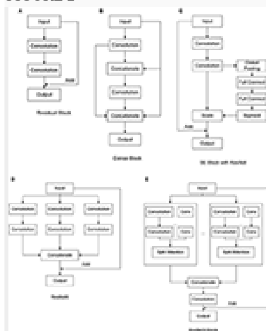
Figure 2. Structures of different convolutional neural network (CNN) models tested. (A) Residual Block, (B) Dense Block, (C) SE Block with ResNet, (D) ResNeXt, (E) ResNeSt Block.