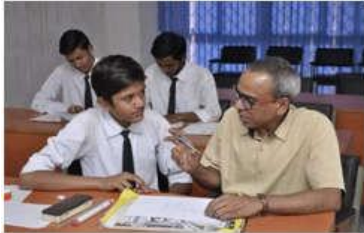
Figure 2. Student Centred Strategy