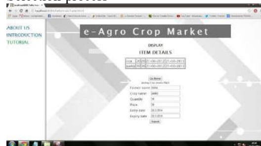
Fig.4 selection process