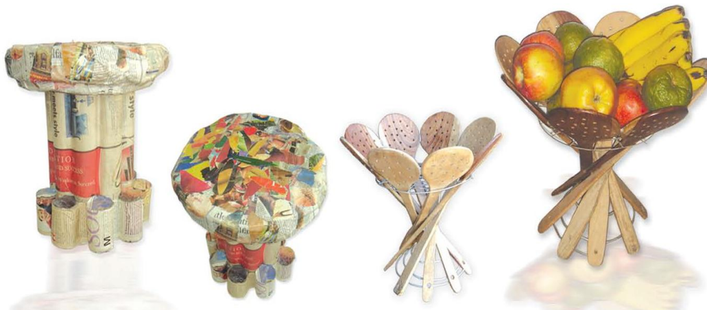
Figure no. 4 Seating Furniture and Fruit basket

By: Prof. Rupesh Surwade, M. Des, PIADS.