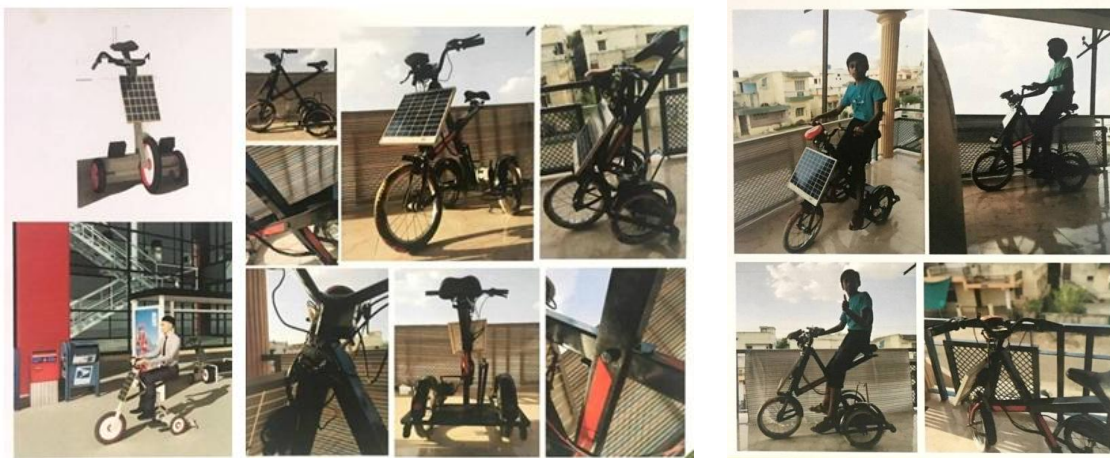
Figure no. 4 Solar Foldable Scooter