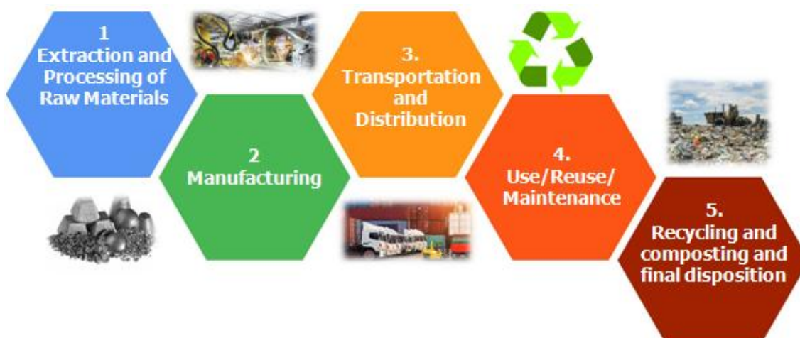
Figure no.3 Stages of Product Life Cycle

The SPLC is a method for examining environmental effects during all phases of a product's life cycle, from beginning to end. From the extraction of raw materials to the final removal of the product, this includes preparation, fabrication, appropriation, use, repair and maintenance, and removal or recycling. (Neelam C. et al., 2014). With raw materials extraction to definitive mien, SPLC illustrates the environmental, social, and economical benefits of products across their whole life cycle. LCA is a tool for analysing the many environmental effects of a product or application.